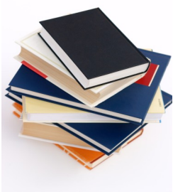
Shop 'til you drop on June 16