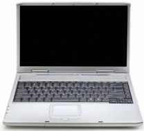
Be careful what you open